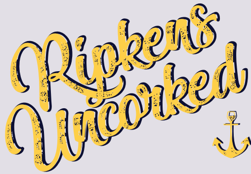
CHART HOUSE | MAY 17, 2018 | 5:30 P.M. - 9:00 P.M. TO BENEFIT THE CAL RIPKEN, SR. FOUNDATION